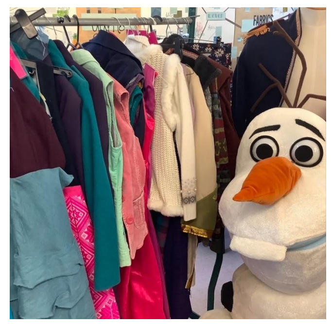
Pictured above – Sven and Olaf getting ready for 'Frozen'...